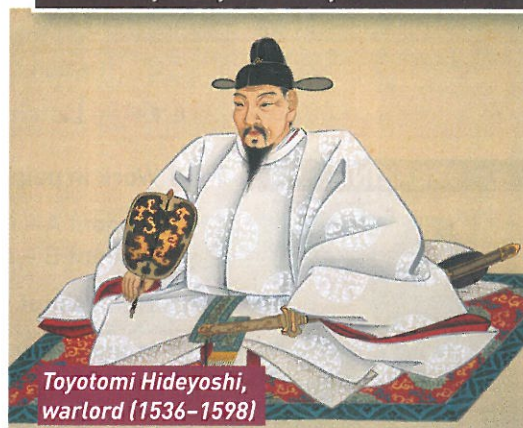
Toyotomi Hideyoshi, warlord (1536–1598)