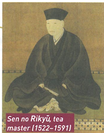
Sen no Rikyū, tea master (1522–1591)