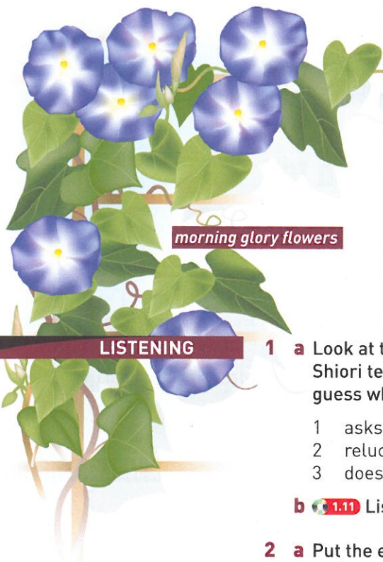
morning glory flowers